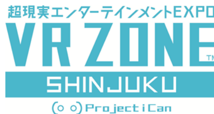
VR ZONE SHINJUKU Logo