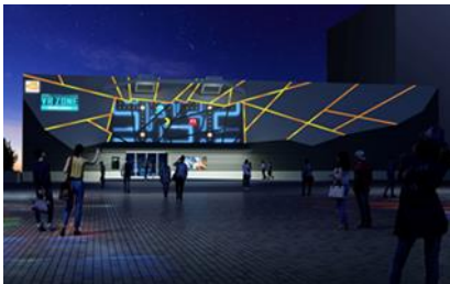
Facility Exterior Image

In addition, BANDAI NAMCO Entertainment Inc. has teamed up with the popular digital art group NAKED to develop projection mapping installations in and out of the facility. The exterior will feature a projection of PAC-MAN among other images, while the inside will feature a 'Centre Tree' posing as the interface of the facility which will allow guests to interact with the building itself through touch.